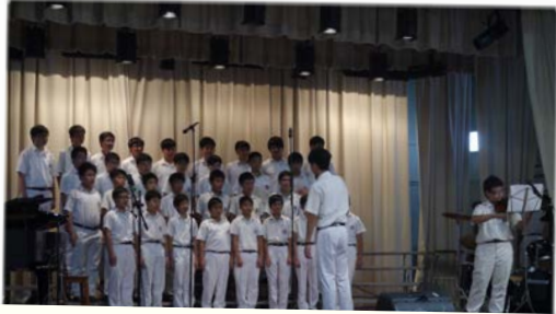
Secondary 1-2 Singing Contest co-organised with the Music Department