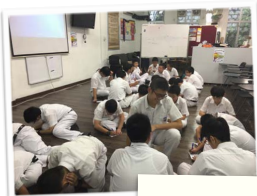
English Society Meetings