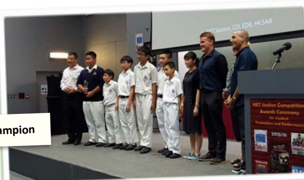
Speak Out Act Up Drama Competition Champion