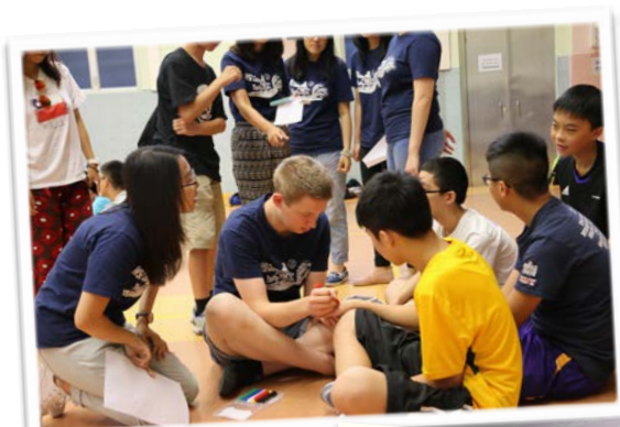
Junior form students participating in Summer Camp