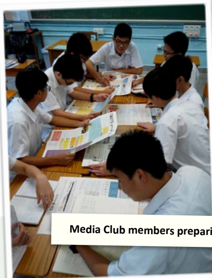
Media Club members preparing for the upcoming school newsletter 'The Salesian'