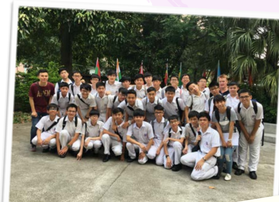
English Ambassadors at Crossroads Workshop