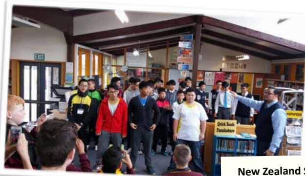
New Zealand Study Tour