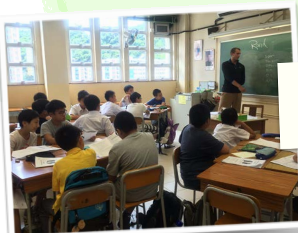
Bridging Courses to help pre-secondary 1 students to get used to using English as the medium of instruction