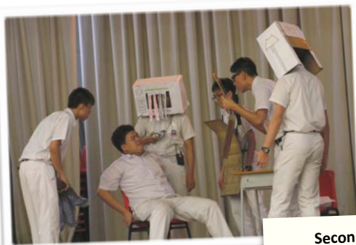
Secondary 3-4 Short Play Competition