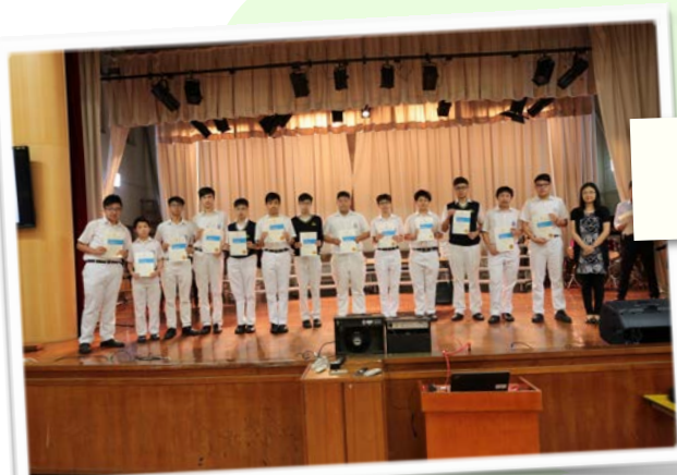
Presenting Certificates to the participants and winners of Speech Festival