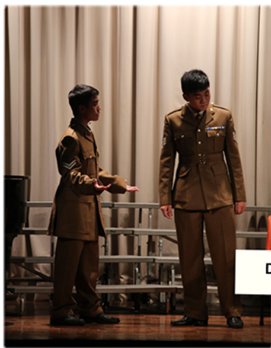
Drama Team performing in school functions