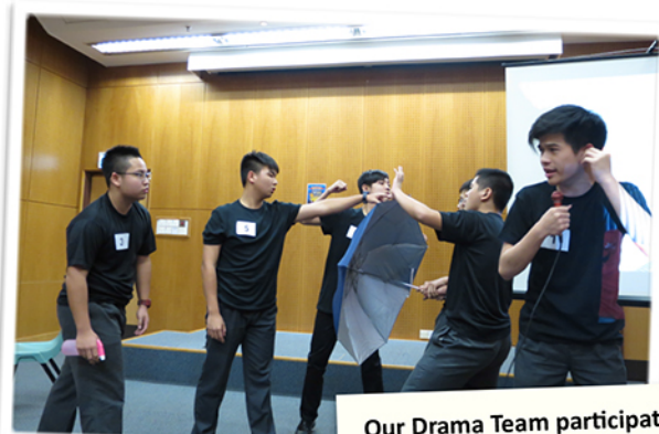
Our Drama Team participated in the drama competition organised by the NET Section last year and won the Best English Award