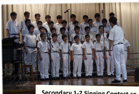
Secondary 1-2 Singing Contest co-organised with the Music Department