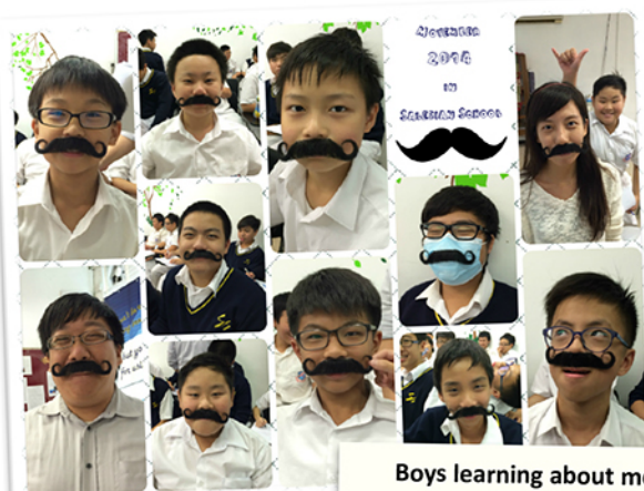
Boys learning about men's health through "Movember"