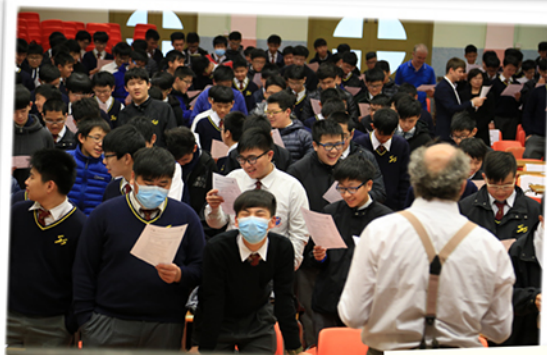
SCOLAR's Drama Theatre for Secondary 3-4