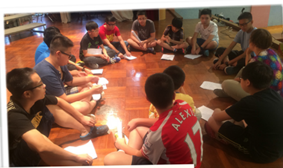
Rehearsing for a drama performance during a summer drama course