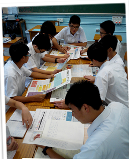
Media Club members preparing the upcoming school newsletter The Salesian