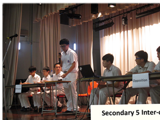
Secondary 5 Inter-class Debating Competition