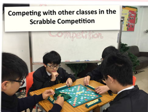
Competing with other classes in the Scrabble Competition