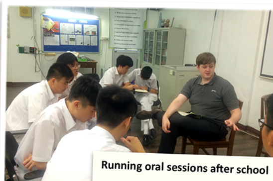
Running oral sessions after school