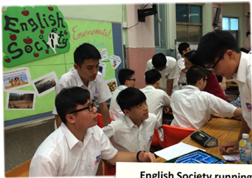
English Society running a language booth in the Language Carnival