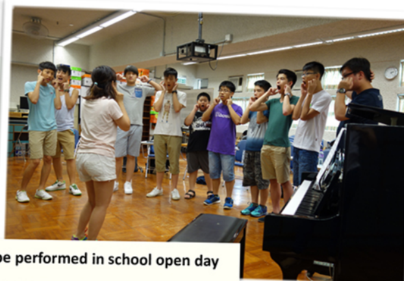
Attending the training for the Musical to be performed in school open day