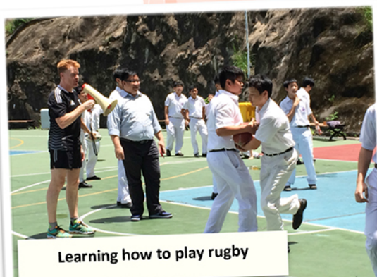
Learning how to play rugby