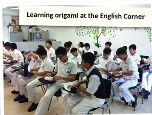
Learning origami at the English Corner