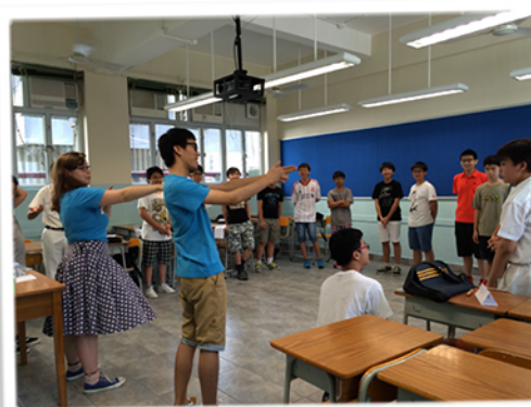
Junior form students participating in Summer Camp