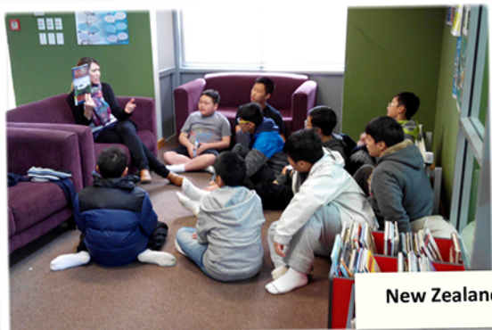
New Zealand Study Tour