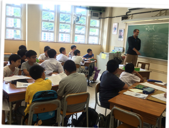
Bridging Courses to help pre-secondary 1 students to get used to using English as the medium of instruction