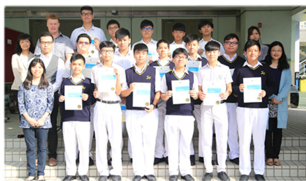
Presenting Certificates to the participants of Speech Festival