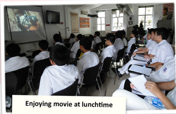
Enjoying movie at lunchtime